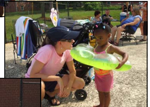
Six families were treated to a fun-filled afternoon at the pool.