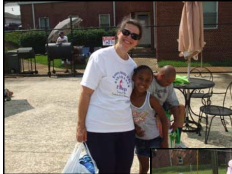
The Square Pegs visit the United Methodist Children's Home in Decatur