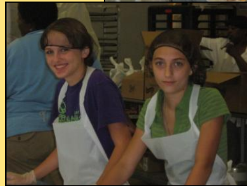
During Youth Week 2009, EHYF members got up early to prepare and deliver meals for Project Open Hand--who says hairnets aren't cool? A picnic at nearby Piedmont Park, complete with Frisbees and tree climbing, seemed like a good way to end the day together.