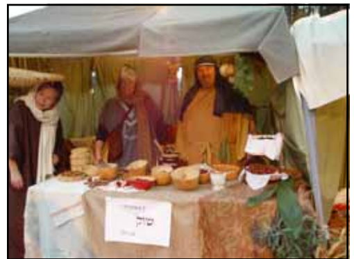
Dates? Currants? Hey, is there a cheeseburger in there?