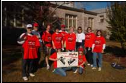
The Embry Hills Walkers Wesley Walk 2008

The trees were peaking their colors and the park was stunning in its beauty and tranquility. Though we were in no rush, we kept a steady pace throughout our walk and spent quality time visiting and sharing. It was truly a spiritual experience.