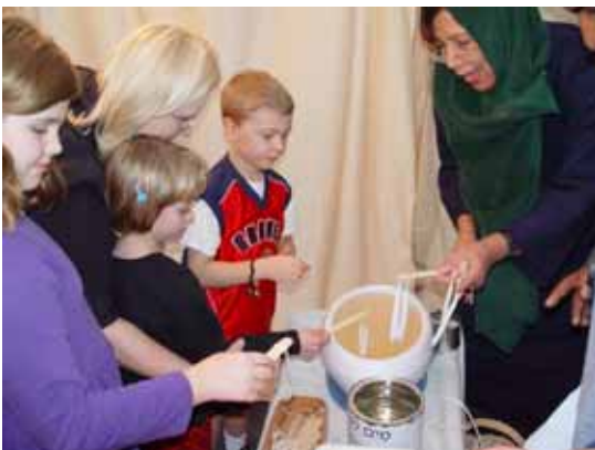
Children making candles in Bethlehem's marketplace.